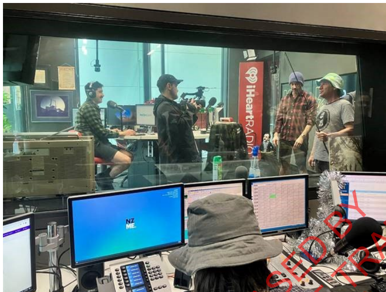
Radio Hauraki 'The Big Show' hosts preparing social media video for the Kia Mataara safer boating campaign

As part of Maritime NZ's Kia Mataara safer boating campaign, we are teaming up with Radio Hauraki to use an entertaining radio "adventure" aimed at reducing harm and promoting responsible behaviour on the water. Radio Hauraki has a fun, authentic style and strong connection to Kia Mataara's core audience, men aged 40+.