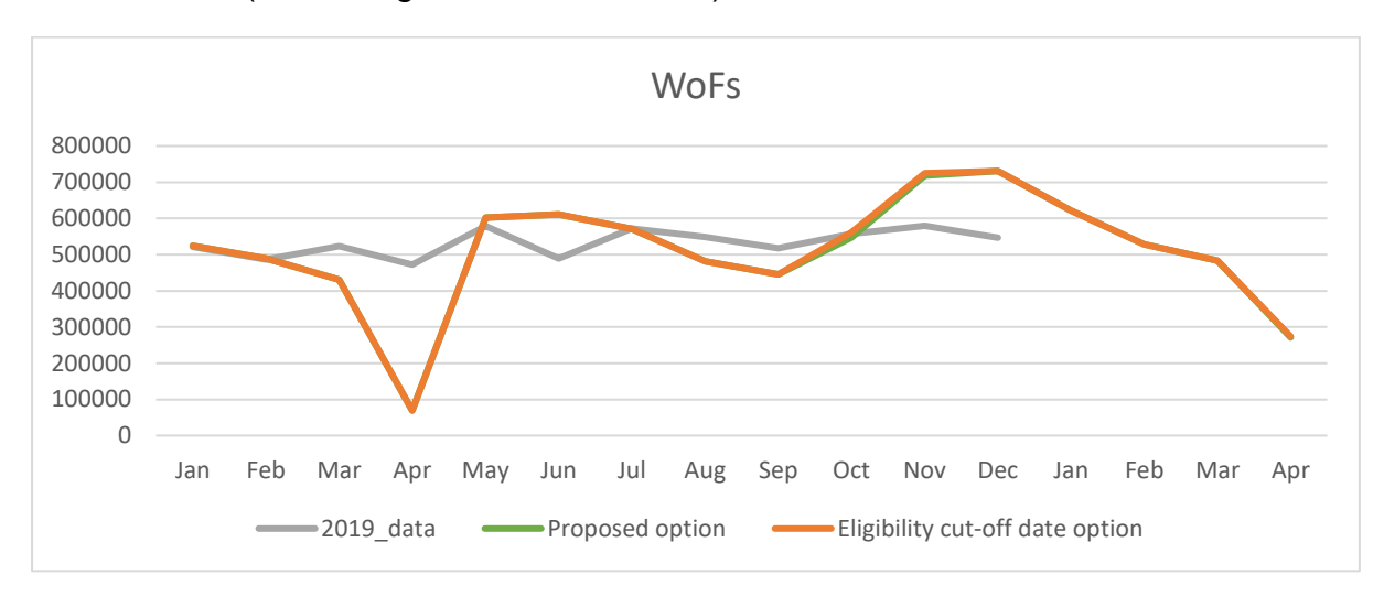
Figure 1: Actual and forecasted numbers of WoF inspections per month under the proposed option and the option of setting an eligibility cut-off date of 31 July 2020